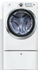
Island White (IW)